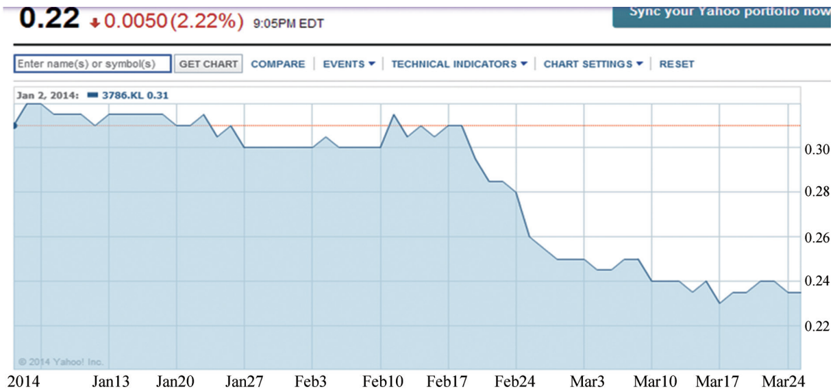
Figure 3 Share Price of MAS

will cancel their travel to MALAYSIAN (as we know travel income is important part of Malaysian). If without the help of government MAS will bank craft. Cause this accident; the insurance will pay million and million cash for it, that's also a big influence on insurance company. In some way the insurance companies also stay in a poor situation. It's like a butterfly effect.