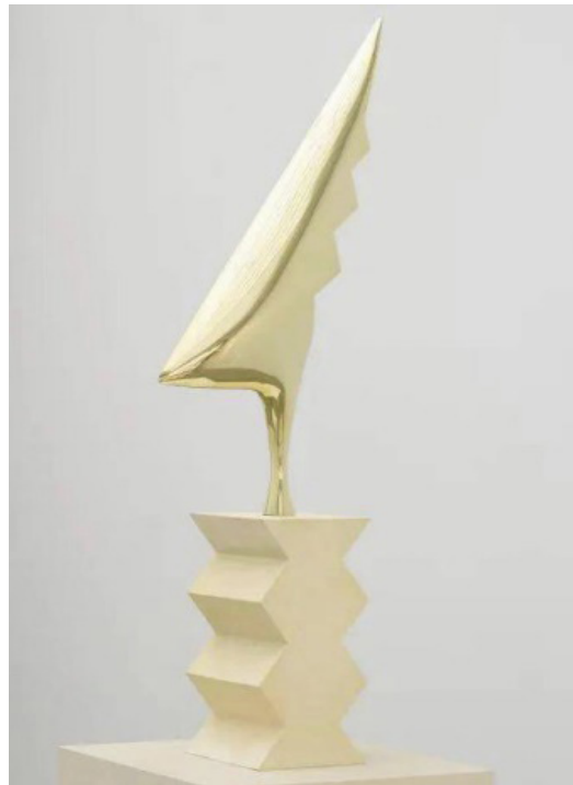
Figure 1 "The Cock" by Constantin Brancusi

(Figure 2) is primarily expressed through a sense of lines and speed. Although it does not realistically sculpt the physical form of a fish, no details of its body or scales, the simplicity of the sculpture evokes the image of a fish swimming in the water. While it does not solidify the image of the animal, it shows the dynamism of the fish.