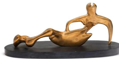
Figure 4 "Reclining Figure" by Henry Moore