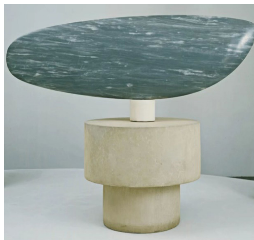
Figure 2 "Fish" by Constantin Brancusi

Abstract forms provide audiences unlimited space for imagination, enabling artists to express their deepest thoughts. They not only convey the artists' creative inspiration but also evoke resonance within the audience.