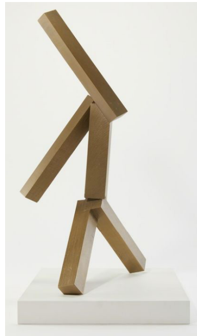
Figure 3 "Untitled" by Joel Shapiro

sculptural language. Artists should fully explore and utilize the expanded selection of sculptural materials, thereby rediscovering and reconstructing new material significances.