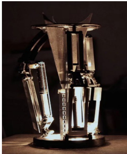
Figure 6 “Home” by Ying Li