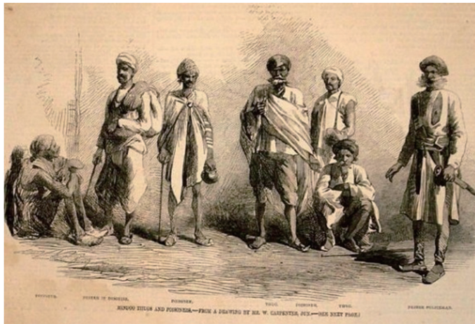
Figure 4 A Drawing About Thuggeries by W. Cafester, Illustrated London News, 1857