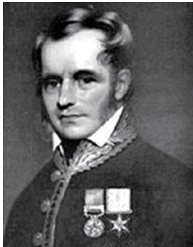
Figure 2 Major William Henry Sleeman, Who Is Known as the Destroyer of the Cult