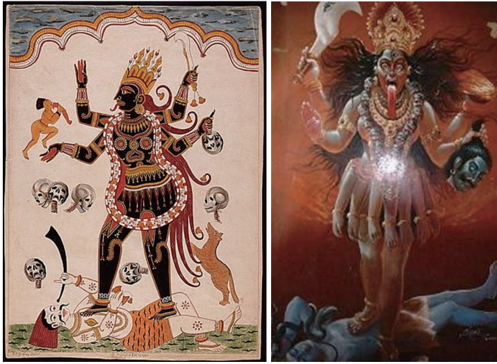
Figure 1 Depictions of Kâli (From the Internet)