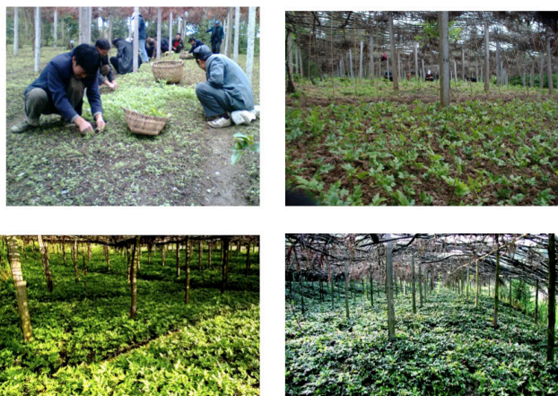
Figure 7 Important steps in nursing seedlings of Coptis at Shizhu