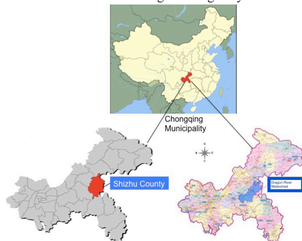
Figure 3 The location of the study site of Shizhu County in the Dragon River watershed in Chongqing Municipality

Shizhu County, officially named as Shizhu Tujia Autonomous County, is located in southeast Chongqing Municipality, China (Figure 3). It is south to the Yangtze River and in the center zone of three gorges reservoir region. Also, it is the only autonomous county for ethnic minorities in this region. Shizhu literally means “stone pillars”, which is named after two big human-like natural stone pillars standing on Longevity Mountain, as described by the informants, which symbolises a Chinese version of “Romeo and Juliet”, who objected to feudal oppression of freedom for love and died together tragically.