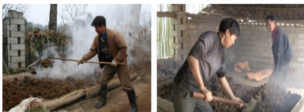
Figure 8 Baking the raw roots of Coptis at Shizhu County