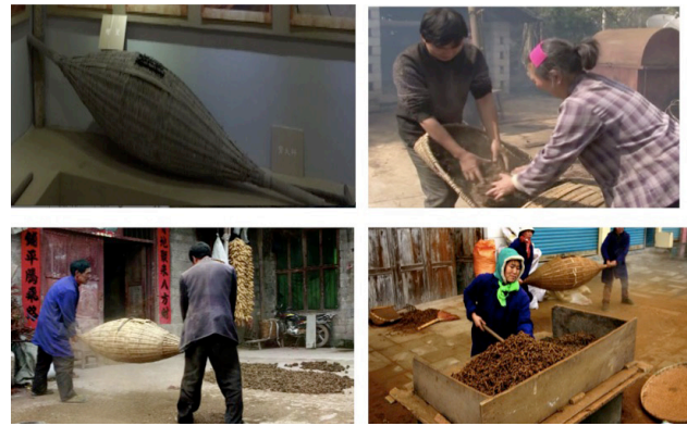
Figure 9 Caging and filtering Coptis at Shizhu County

Some farmers might use the machine to dig up land if Coptis was to be planted on certain flat terrain, but only a relatively small portion of them would do that. Although the machine can even reduce the workload as well as avoid a lot of labor costs (i.e. weeding and other more relaxed work-eighty RMB a day, scaffolding and other heavy work-150-200 RMB per day). However, that means of cultivating Coptis with machines could not produce high quality Coptis, as machines dig the shallow soil and made it easier to be compacted with rain, which would be detrimental to the roots of Coptis. Given those soil factors described in previous sub-section, Shizhu Coptis traditional production system was preserved and inherited with its advantages.