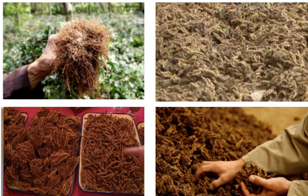
Figure 2 Rhizome of Coptis Figure 1: Coptis, the Plant

Coptis chinensis is indigenous plant in China, particularly those cool areas and edges of forests, which are primarily located in the provinces of mid and southwest China, including Hubei, Sichuan, Yunan and Chongqing. It grows best in damp boggy spots in woods with light, slightly acidic soils and much moisture.