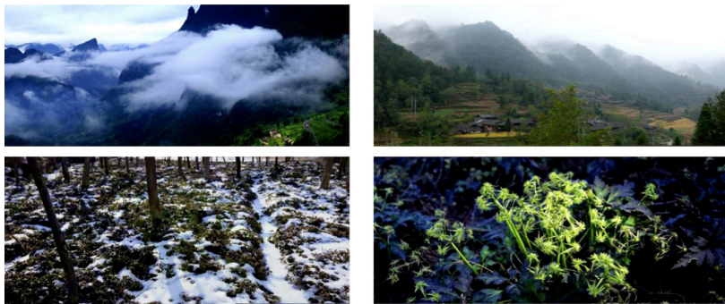
Figure 5 Ecological feature of Shizhu in the watershed

The Dragon River, as a tributary of the Yangtze River, originates in Shizhu, the junction of Hubei province and Chongqing municipality, and traverses in the mountains, valleys and hills, covering 164 km, among which 104 km was in Shizhu County. The Dragon River flows through more than twenty towns and villages in Shizhu and Fengdu counties, where it forms the unique Dragon River watershed. Because of its geographical conditions with valleys, water basins and mountainous areas in the vicinity of 30 ° N latitude, it is very difficult to carry out the large-scale agricultural production. However, it is more likely to be suitable for the growth of Coptis. There is a local saying that no other species expect Coptis could grow in that piece of land, which reflected the interdependence of the nature and the people with right choice to maintain sustainable ecology, at the mean time support the livelihood locally.