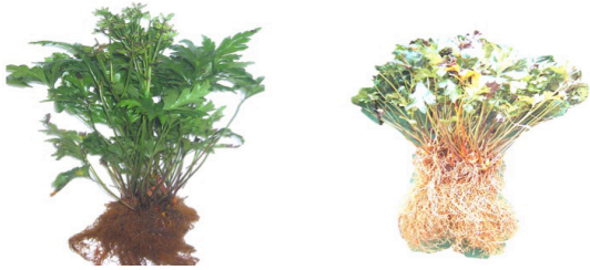
Figure 1 Coptis, the Plant