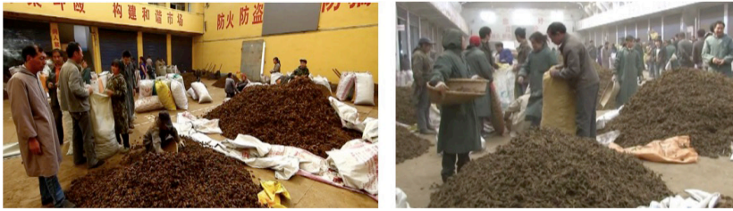
Figure 4 Coptis market in Huangshui, Shizhu County