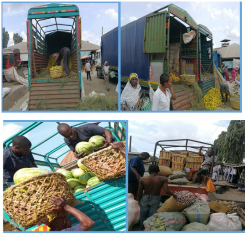
Figure 1 Using less improved storage facilities within a truck

Moreover, poor loading and offloading technology has been associated to causing PHL as attested by around 56.36% of the respondents. Respondents emphasized that in most cases picking up for fruits and vegetables specifically during loading and offloading to the trucks were done manually by individuals who would like to maximize their income through a number of trucks they load/offload. In this case, they are careless in handling FFV. All this is caused by lack of recommended standard loading and offloading equipment as further shown in the photos below: