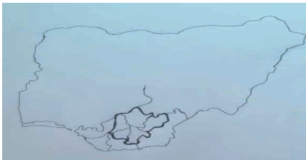
Former Eastern Region Map showing the Igbo of Nigeria in West Africa