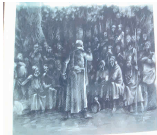
An artist's pencil impression of traditional Igbo meeting setting

Ubani, K. (2019). Igbo Leadership Through the Visual Arts: Back to the Future. Canadian Social Science , 15(7), 29-39. Available from: http://www.cscanada.net/index.php/css/article/view/11096 DOI: http://dx.doi.org/10.3968/11096