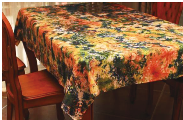
Figure 7 Show the Leaf and Flower Morphology by Tie-Dyed

The national style textiles with plant textures will select representative colors according to national features, and in most cases the colors will be relatively rich. In the aspect of technology, except for the common printing and jacquard weaving, different nations have their characteristic technologies, such as tie-dyed, batik and embroidery in different techniques. As seen in Figure 7, the growth forms of leaves and flowers are presented in the means of tie-dyed, so that they are suitable for the home environment of national style and have profound cultural connotation.