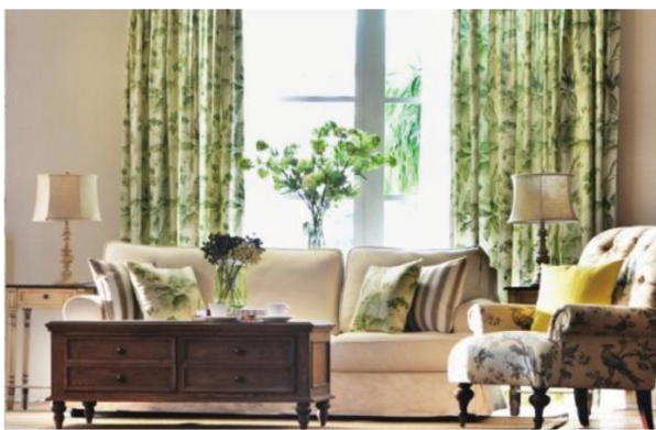
Figure 3 The Harmony of Texture