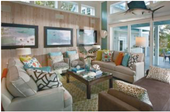
Figure 2 Different Color Ratio