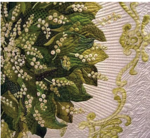
Figure 5 Show the Petal Texture by Patchwork Quilting

The cotton and linen textile fabrics with plant textures are very important elements to be used in the natural style decoration. The texture feeling of plants and the natural style can be well coordinated to show a natural and remote feeling. The textures of all kinds of flowers and plants have been the important source of design inspiration for fabrics in natural style soft decoration. Designers will add the textures of plants into the natural style fabrics in the graphic combination way or other special techniques. The textiles with plant textures in the natural style home environment have a wide range of