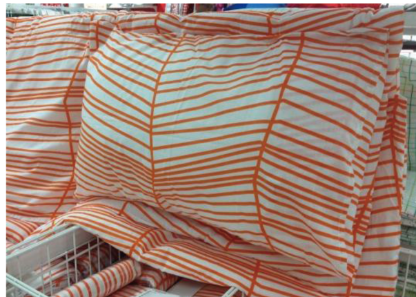
Figure 6 Plant Texture in Modern Textile

In the application of design practices in Figure 6, the design conception of fabrics patterns comes from the main vein direction of leaves and the generalized lines are