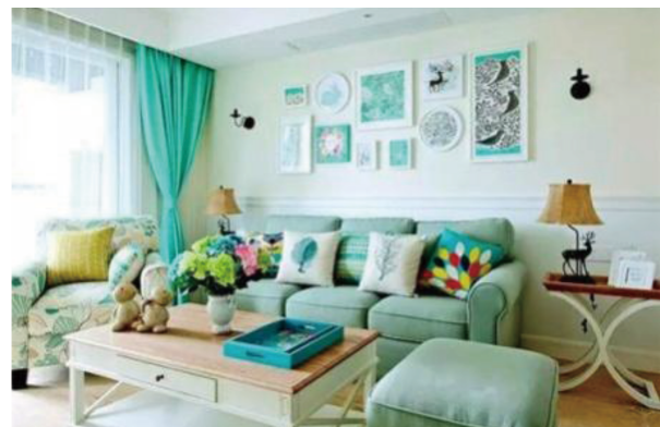
Figure 1 The Same Color Tone

The color matching of textiles with plant textures influences the psychological changes of people, and the reasonable color matching plays vital role in the soft decoration of home furnishing. In the home environment of one same space, the textiles generally select the same color motif and adopt the proper color matching percentage based on the changes of colors in purity, lightness and hue (see Figure 1) or the principle of color uniformity, so as to achieve the atmosphere of coordination and uniformity, and make the overall home environment beautiful but not disordered, active and not stiff (see Figure 2).